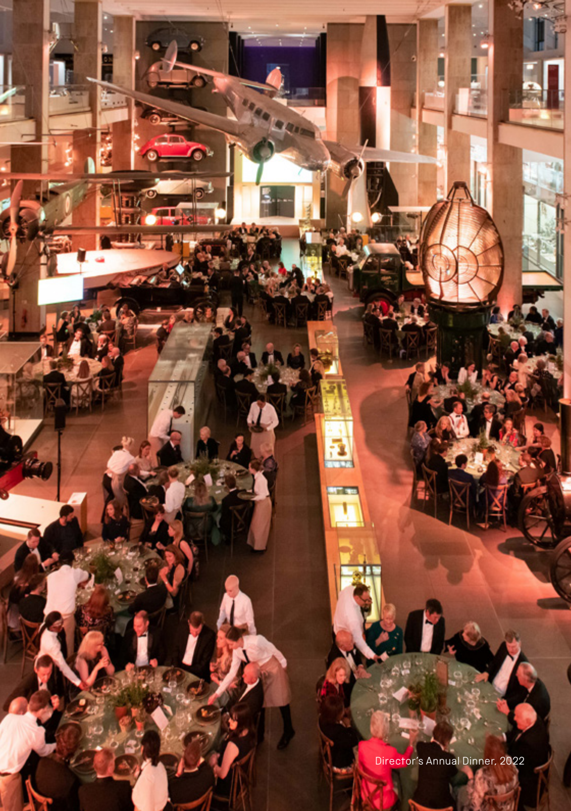
Director's Annual Dinner, 2022