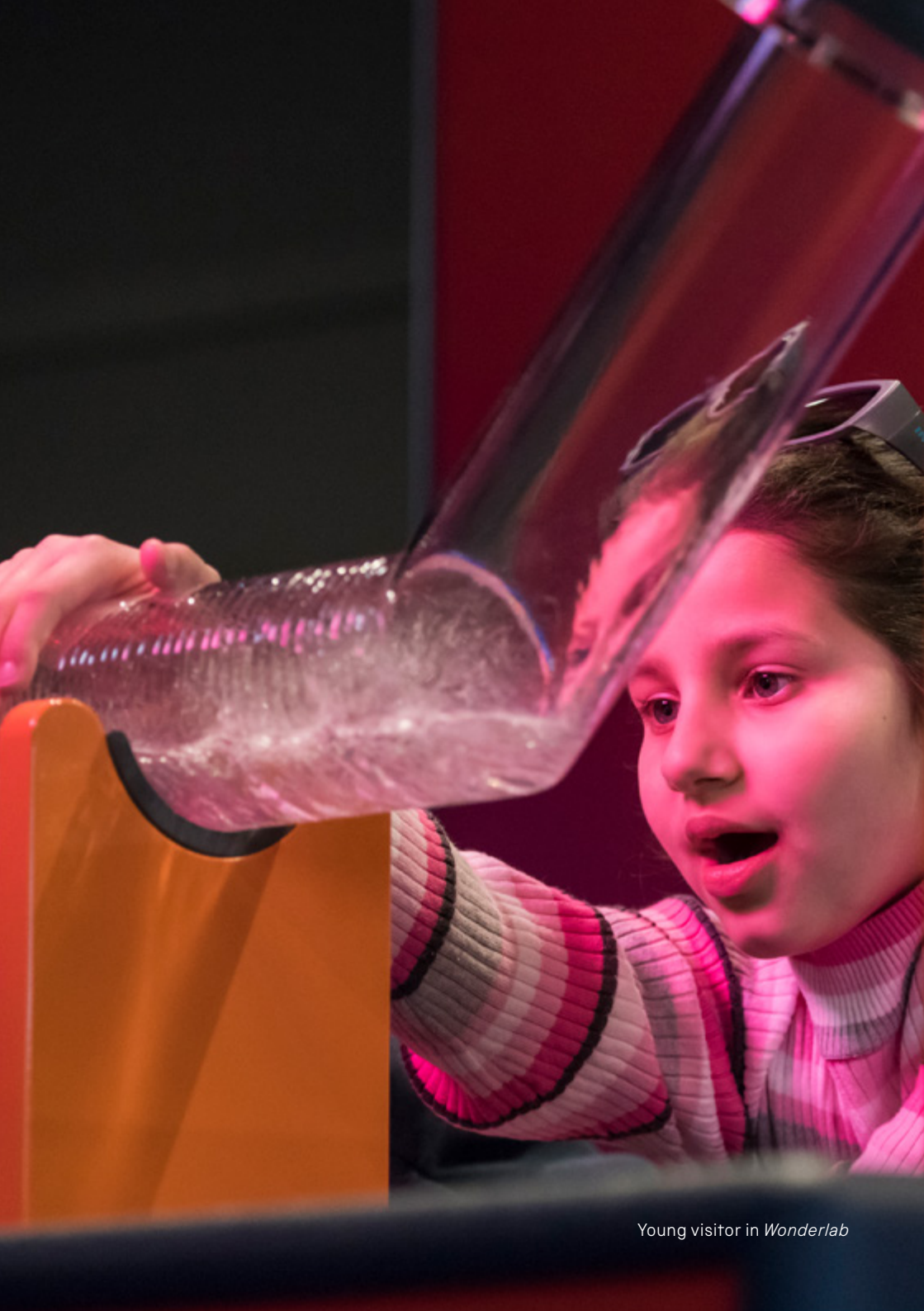
Young visitor in Wonderlab