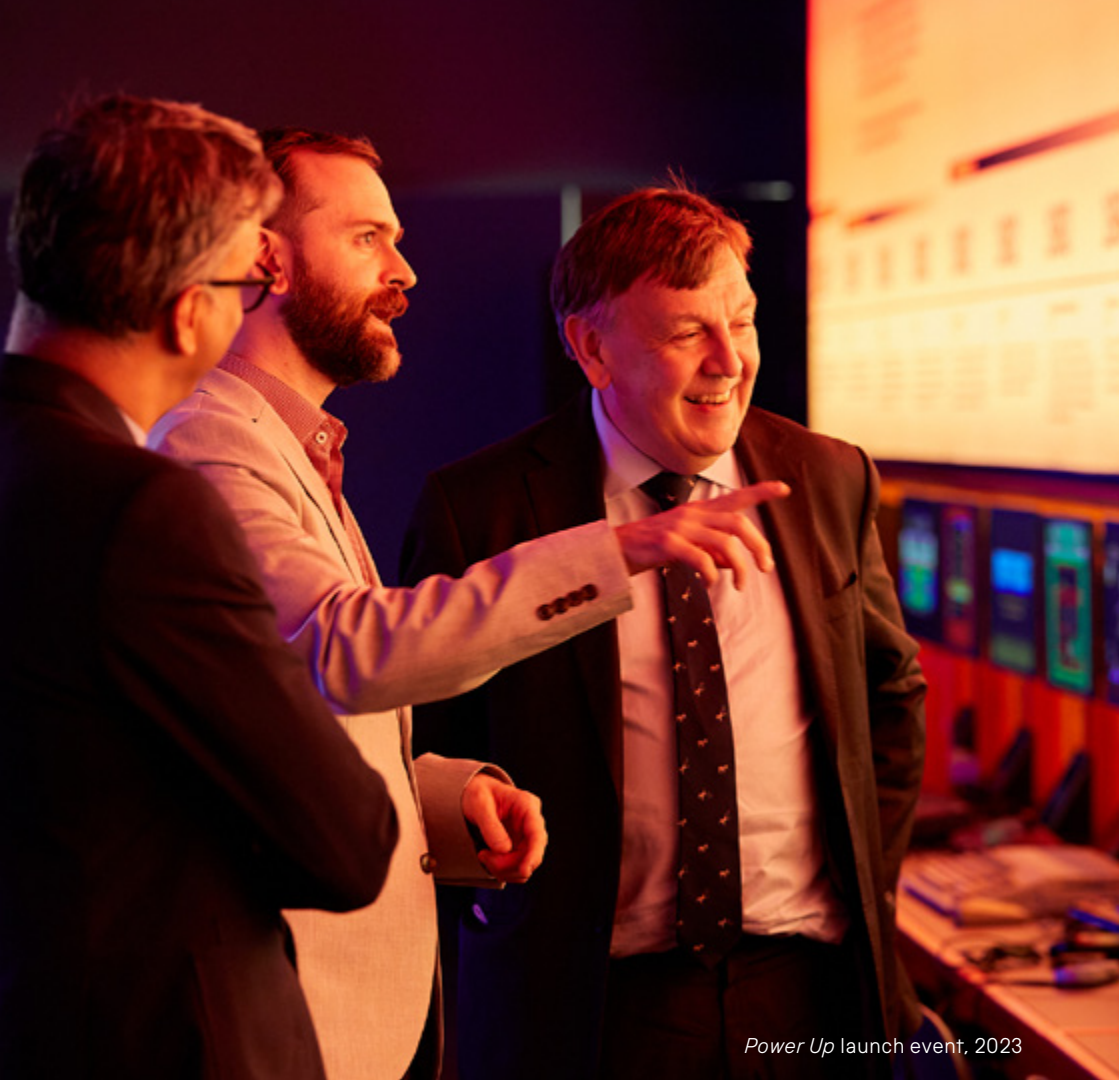
Power Up launch event, 2023