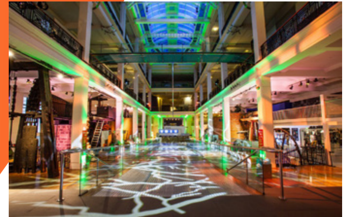
The Energy Hall at the Science Museum

US citizens living in the UK and the US can make tax-efficient donations via the UK and US Friends of the Science Museum. If you would like to benefit from this, please contact the Patrons Office.