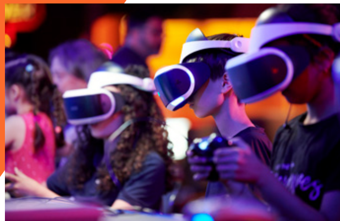
Visitors enjoying Power Up

'As a Patron I have the wonderful opportunity to extend my learning – every day is a learning day – through meeting other Patrons and their guests at regular exciting and often enthralling events.'